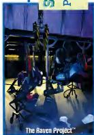
The Raven Project™